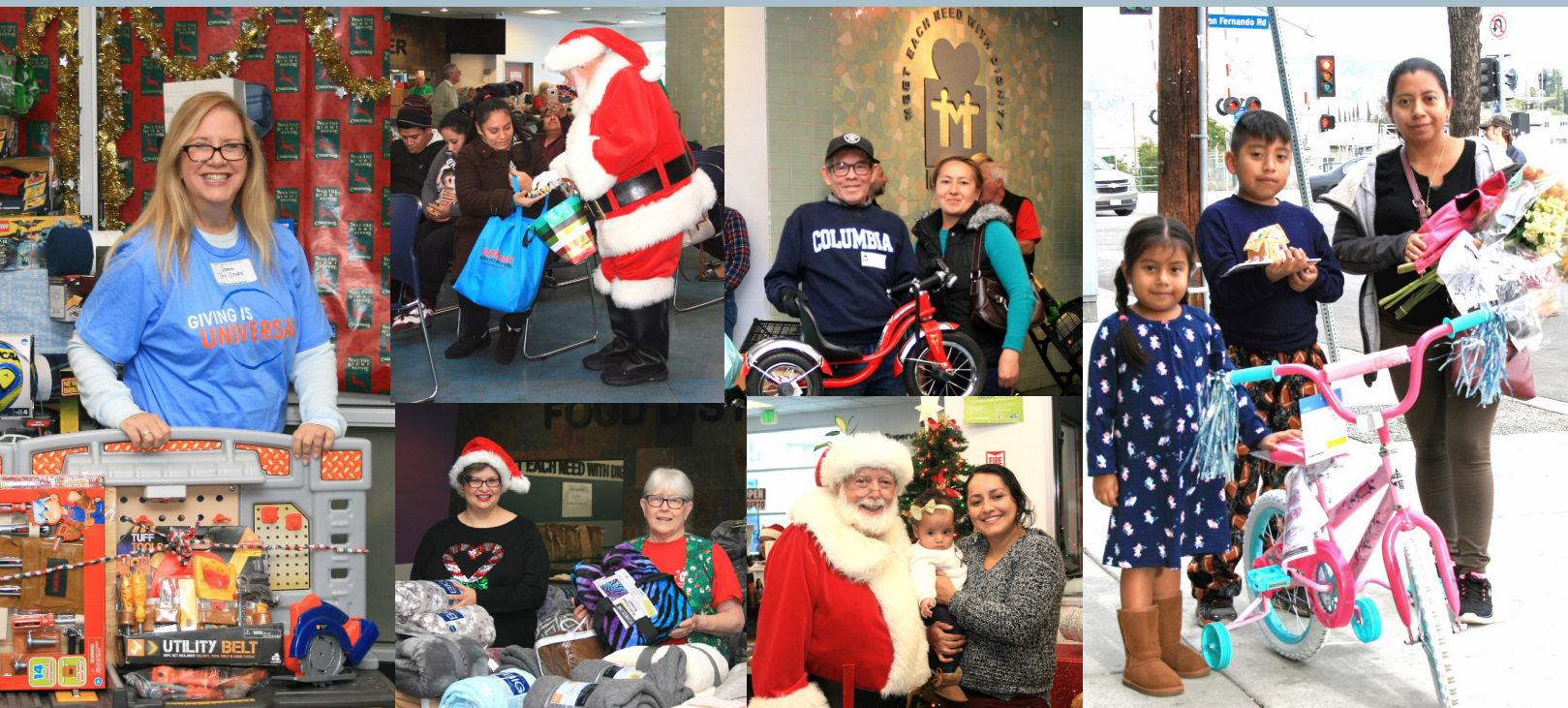
Because of you, over 2,000 families and individuals experiencing homelessness, had a less stressful and more joyful holiday in 2018. Thank you!